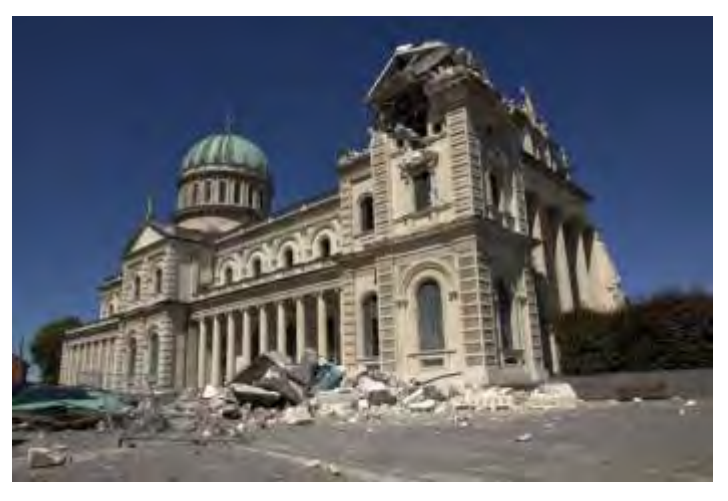
If you don't have BC Plans, develop them and practice them - Allan Freeth

media, we had accounted for all our staff and found them as far afield as Invercargill.