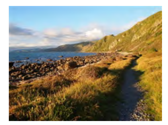
New Zealand is New Zealand is geographically, and economically, isolated - Alan Bollard

In Wellington, parts of the CBD and near the airport are vulnerable to a combining all of these hazards – with liquefaction, tsunamis and strong shaking also challenging in Petone and Wainuiomata. New Zealand's characteristics as a nation are important too. Being geographically and economically isolated, when significant challenges confront us, it may be with little external financial support. An event like a major earthquake has so many uncertainties, it can be difficult to plan crisis-responses in detail.