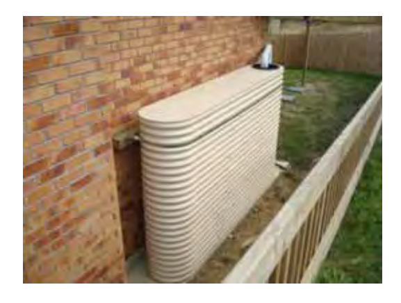
Figure 10: A seismically restrained 1,000 litre rainwater at a dwelling in the North Shore

All rainwater tanks should be placed on a 100 mm sand base, which should be boxed in to prevent erosion of the sand. Base isolation should be sufficient for tanks to withstand the stresses imposed on a tank during an earthquake and base isolation should neutralise tank sloshing (the wave velocity acceleration that causes the tanks to move around). Thus, we do not believe it practical or indeed necessary to put seismic restraints or bracings on large, wide rainwater tanks, but it may be prudent to do so on the smaller and thinner tanks. (Figure 10).