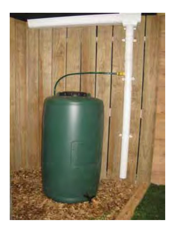
Figure 8: 250 litre rain barrel connected to down pipe via water collectors/diverter

Installation of a 250 litre or 600 litre rain barrel is a straightforward process and can be done by a home handy man or woman, within an hour. This includes the time necessary for cutting the down pipe, installing the water collector/diverter and linking the rain harvesting the system to the barrel (Figure 8).