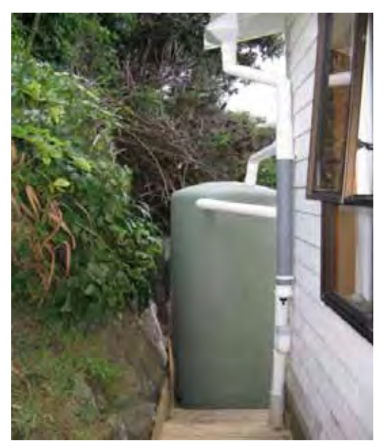
Figure 5: A 1,000 litre rainwater tank with screened rainhead and first flush diverter installed at dwelling in Paekakariki

The catch cry "Store lots of water - the more you store, the longer you'll be self-sufficient" is very sensible, but drawing on recent events in Christchurch, more should be done by way of incentives to encourage householders in urban environments to install rainwater tanks or barrels (Figure 5).