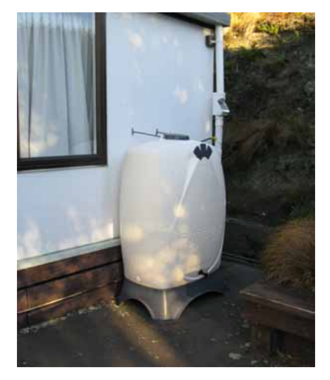
Figure 4: A 600 litre rainwater tank with screened rain head and down pipe water collector at Wellington East Girls College

Potential sites for locating additional large rainwater storage tanks (25,000 litres minimum) include the following: