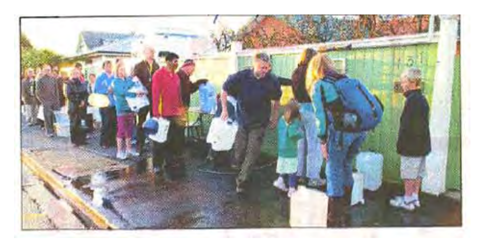
Residents queuing for water in Opawa Road, Waltham, Christchurch (Picture NZPA 14/06/2011)

People required water, not only to drink, wash and cook with, but also to damp down choking dust and to use with temporary toilets. In the first days following the February 22 quake, people waited up to five hours for water at some welfare centres (Red Cross verbal briefing, 1 March 2011). Ten days after the February earthquake, queues of up to 50 people were still a common sight at some water distribution points, (Moore, personal observation, March 2011).