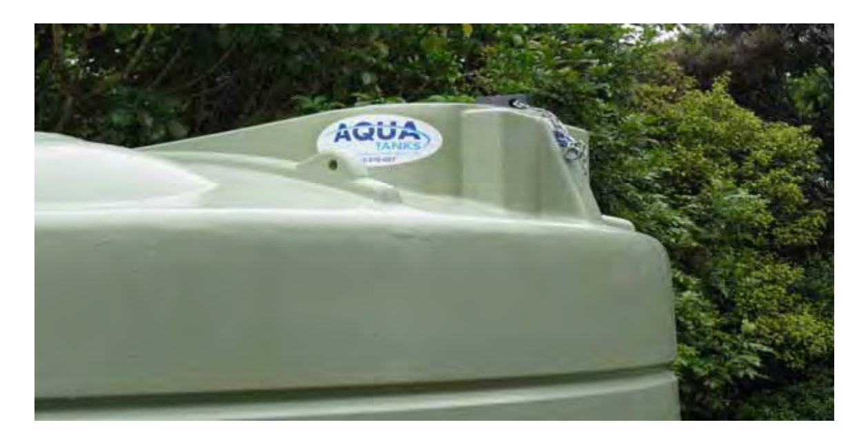
Figure 1: Emergency rainwater tank with locked access cover at Pukerua Bay School

To prevent vandalism and accidents all the tanks have locked access covers and all the taps have been removed, so as to prevent accidental or unwanted draining of the water in the tanks (Figures 1 and 2). All the emergency rainwater tanks have "Boil for 1 to 5 minutes" labels clearly displayed (Figure 3).