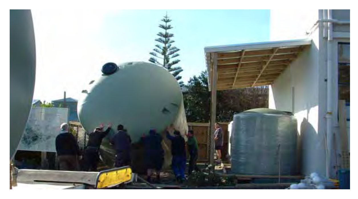
Figure 7: Unloading a 25,000 litre rainwater tank at the Roof Water Research Centre at Massey University in 2005

Galloway International (AquaTanks) in Auckland manufacture stackable rainwater tanks that range from 2,000 litres to 6,000 litres. These tanks have been designed for container shipping and are moulded as a single unit then the lids are trimmed off so the tanks stack inside each other in a shipping container with the lids packed around them (Personal communication, Martyn Jones, AquaTanks 03/06/2011). The lids simply sit on top and are fixed with some stainless screws and hence the tanks can be emptied and moved into storage to be re-used. Galloway International can place about 70 x 5000 litre tanks and lids in a 40-foot high cube container. They envisage a Hercules Transport plane could shift quite a number of these stackable rainwater tanks urgently from Auckland to Wellington, immediately after an earthquake. Galloway International needs approximately 12 to 15 days to mould about 100 rainwater tanks. Last year they supplied 70 x 5000 litre stackable rainwater tanks to the International Red Cross for post earthquake purposes.