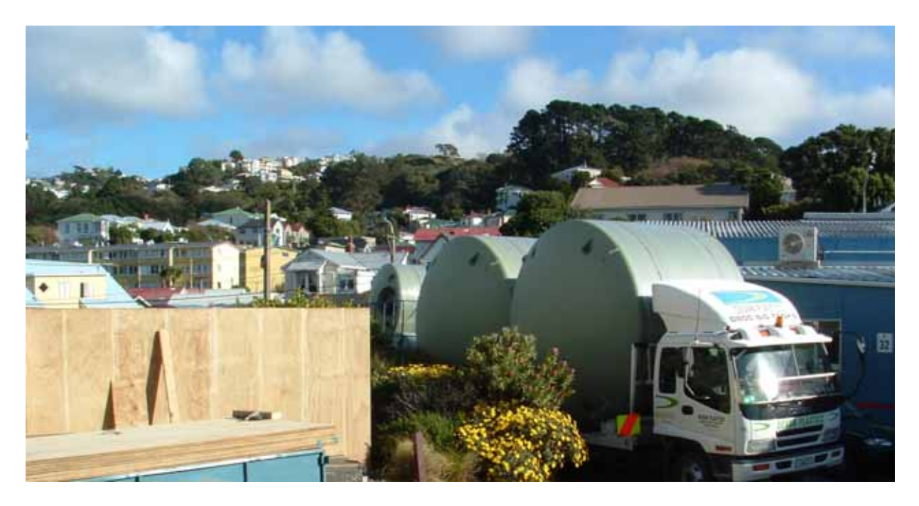
Figure 6: Two 25,000 litre and four 5,000 litre rainwater tanks being delivered to the Roof Water Research Centre at Massey University in 2005.

Regarding installation of rainwater tanks post-earthquake, it must be appreciated that the transportation of tanks by road may be challenging especially if there is severe damage to major road networks leading into Wellington. Although one of New Zealand's major tank manufacturers is based in Tauranga, the majority of tank manufacturers and suppliers are based in Auckland. Devan Plastics in Tauranga usually carry a stock of twenty 25,000 litre tanks, fifty 5,500 litre tanks and on hundred 1,000 litre tanks (Personal communication, Gail Swanepoel, Devan Plastics 07/05/2011). If required, they can manufacture up to five 10,000 litre and 25,000 litre per day. Devan Plastics have 5 reticulated trucks that could deliver twenty 25,000 litre tanks to Wellington every second day (Figures 6 and 7). The smaller 1,000 litre and 5,500 tanks are usually delivered via a freight company.