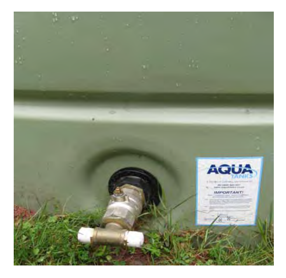
Figure 2: Emergency rainwater tank without taps at Pukerua Bay School