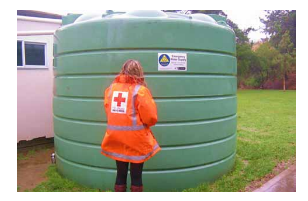
Figure 3: Emergency rainwater tank with "boil water" sticker at Adventure School